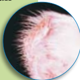
Ear tip of a cat showing cancerous changes