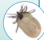
Adult tick (life size)

Please ask us to advise you on the best form of flea and tick control for your pet.