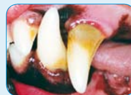
Gingivitis with mineralised plaque (calculus, or tartar), and inflamed gum margins

up for your pet, or would like to learn more about routine dental care in dogs and cats.