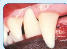
Healthy Mouth in a dog, with white teeth and healthy pink gums.

Recent surveys have shown that 85% of dogs and 70% of cats over three years of age have some form of dental disease. Prompt recognition of any problems in the mouth gives the best chance of successful treatment. Please contact us if you would like a check-