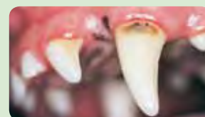
(2) Gingivitis – with early calculus