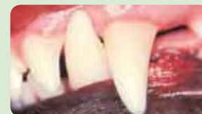
(1) Healthy mouth