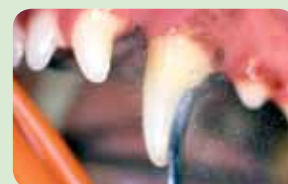
Removing the calculus using an ultrasonic scaler, followed by polishing the teeth is a very effective form of treatment